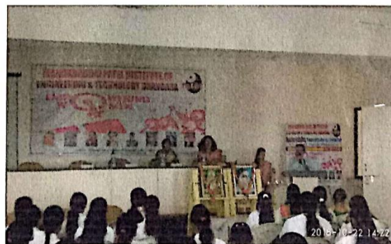
Few pictures of the programme