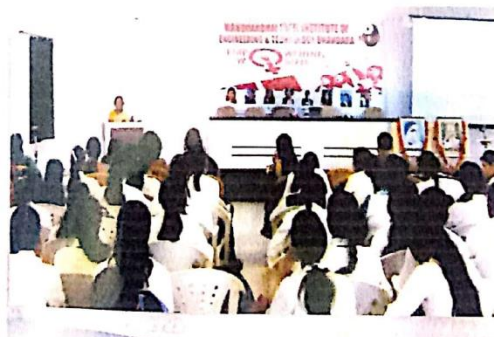
Few pictures of the above programme